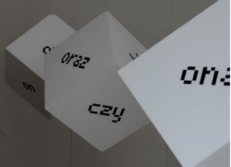
Figure 2. Project "Meta" by PJIIT student Bogna Kowalska at European Culture Congress 2011