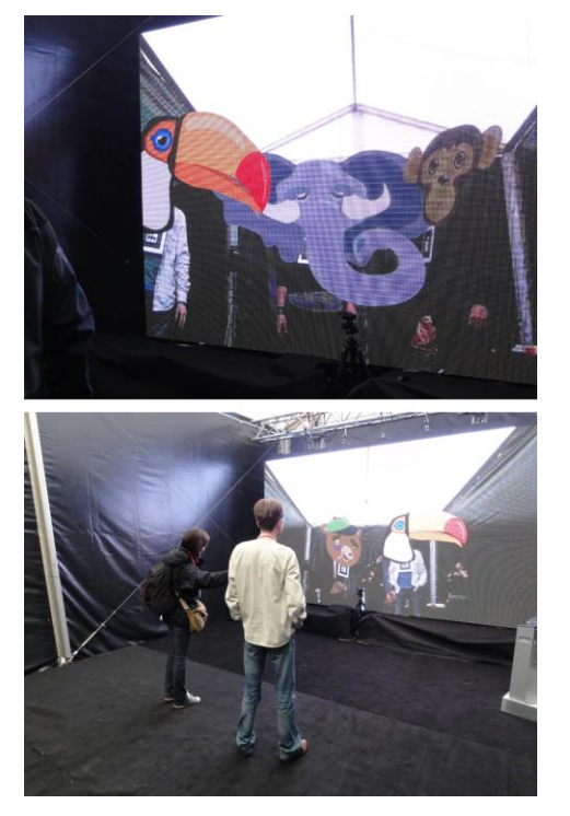
Figure 6. Interactive installation "Become Whom? Him!" at Burn Festival 2012

addressed to children and its main goal was to show funny animated animal faces instead of markers on a big LED screen, see Figure 6. The project attracted hundreds of visitors each day and aroused great interest.