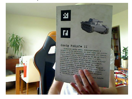
Figure 10. AR experience in PJIIT students project "Multimedia reconstruction of battle September 1939" using Advanced SDK for AR

Figure 9. AR in PJIIT students' project "Using FLAR technology in Adobe Flash for multimedia presentation of car manufacturer"