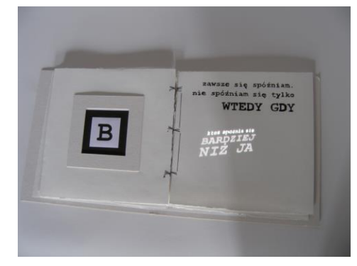
Figure 5. Project "Out of Context" by PJIIT student Bogna Kowalska

Both editors are really popular among art students and examples of their works are presented in next chapters.