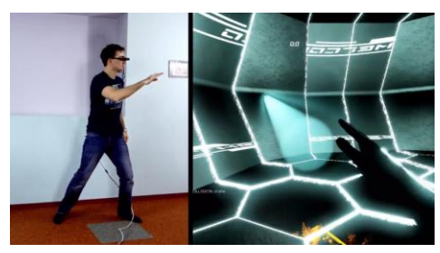
Figure 12. Gameplay from thePJIIT student's project "Immersive 3D game using natural interface and virtual reality glasses"

Figure 11. AR experience on cube in PJIIT students project "Augmented Reality – interactive story based on Julian Tuwim Glasses"