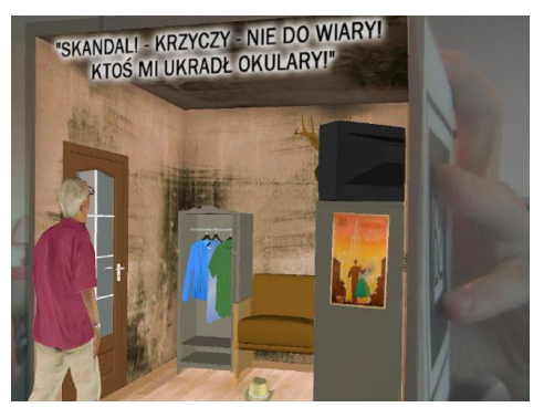
Figure 11. AR experience on cube in PJIIT students project "Augmented Reality – interactive story based on Julian Tuwim Glasses"