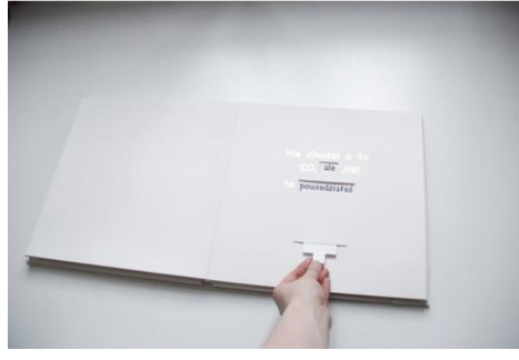
Figure 4. Part of artistic diploma "wo/man" by PJIIT student Bogna Kowalska