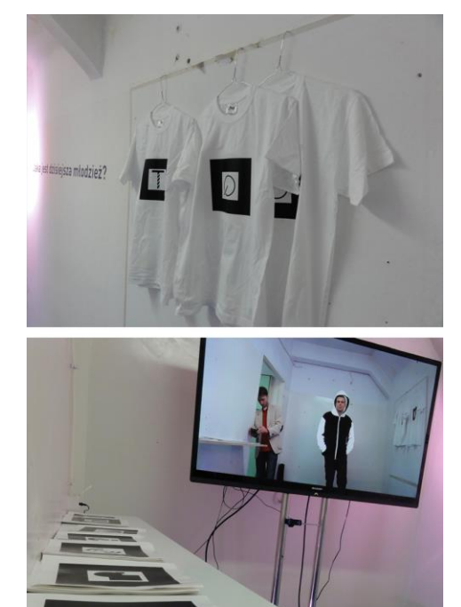
Figure 3. Project "What's the youth of today like?" by PJIIT students at Culture 2.0 Conference 2011

makers (size of the printed marker/precision of scanned 3D object), the distance of the viewer from the camera, etc. In the case of projects for mobile devices, more complex prototypes are needed, taking into considerations the range of devices, screen resolutions, mobile features (gestures, geo-location, accelerometer etc.) and performance.