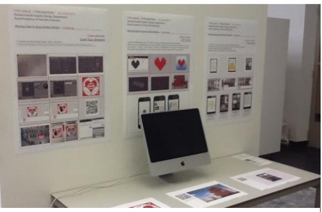
Figure 7. AR workshop at TYPE=IMAGE / TYPE-EMOTION 2013

AR Photo task turned out to be very good introductory exercise which gave students idea of how this technology works and resulted in new ideas about using it.