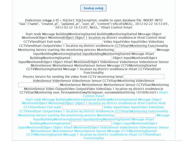
Fig. 3. Functional errors in the Platel application

After gathering the results we were able to assess how each of the test methods has helped us in evaluating the user interface in a SOA-based system.